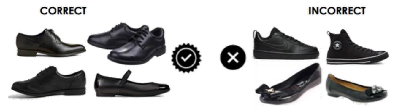
Plain black shoes only. No rubber style shoes and no embellishments.